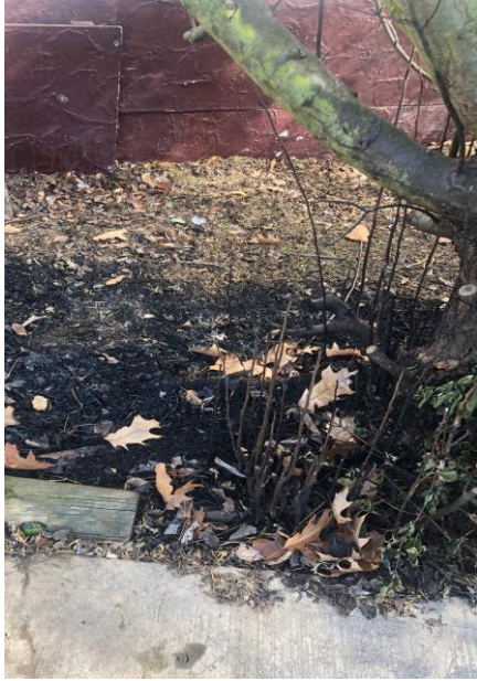
Photos above and below show some of the spot fires that the owners were able to extinguish.