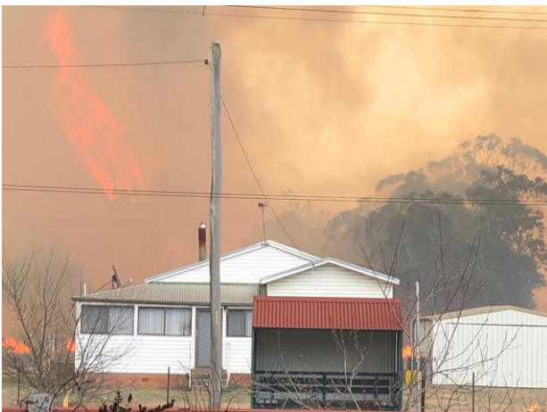
The ferocity of the fire and threat to homes was not to be underestimated.